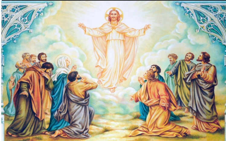
THE ASCENSION OF JESUS [Acts 1: 1-11]

Reconciliation: Saturdays 4:00 to 4:30 pm or request an appointment (St. Anne Osoyoos) or by appointment Following 6:30 pm mass on Saturday (Christ the King Oliver) or by appointment Baptisms: Contact the Pastor 2 months in advance Weddings: Contact the Pastor 6 months in advance