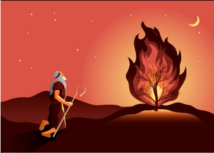
MOSES BEFORE THE BURNING BUSH [Exodus 3 ]

Reconciliation: Saturdays 4:00 to 4:30 pm or request an appointment (St. Anne Osoyoos) or by appointment Following 6:30 pm mass on Saturday (Christ the King Oliver) or by appointment Baptisms: Contact the Pastor 2 months in advance Weddings: Contact the Pastor 6 months in advance