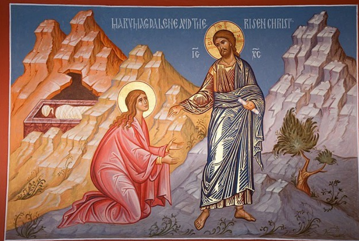
Jesus and Mary Magdalene near the garden tomb [John 20]

Reconciliation: Saturdays 4:00 to 4:30 pm or request an appointment (St. Anne Osoyoos) or by appointment Following 6:30 pm mass on Saturday (Christ the King Oliver) or by appointment Baptisms: Contact the Pastor 2 months in advance Weddings: Contact the Pastor 6 months in advance